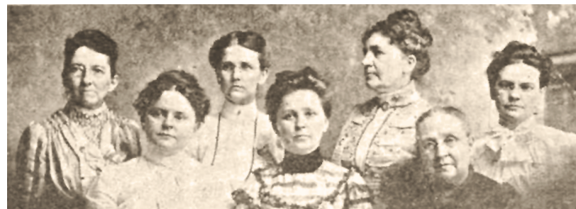
Baptist women mission society members

In the eighteenth century, American Baptists quickly moved west to the frontier areas, built new churches, and established associations, but they were slow in forming formal mission organizations. In the first 160 years of Baptist life in the United States, missionary work was haphazardly organized and carried out by associations and regional societies. Among those earliest societies formed was the Boston Female Society for Missionary Purposes. Founded in 1800 by eight Baptist and six Congregational women, the society raised money for mission work on the frontier and later for British Baptist mission endeavors.