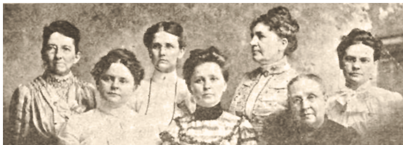
Baptist women mission society members

In the eighteenth century, American Baptists quickly moved west to the frontier areas, built new churches, and established associations, but they were slow in forming formal mission organizations. In the first 160 years of Baptist life in the United States, missionary work was haphazardly organized and carried out by associations and regional societies. Among those earliest societies formed was the Boston Female Society for Missionary Purposes. Founded in 1800 by eight Baptist and six Congregational women, the society raised money for mission work on the frontier and later for British Baptist mission endeavors.